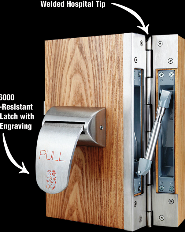
6800 Hospital Latch Quiet Glide Technology