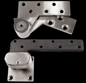
0147 Top & Bottom