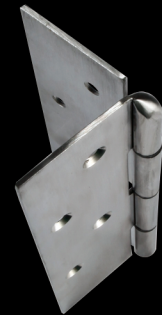
Stainless Steel Pin and Barrel Hinges