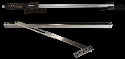
Overhead Holders & Stops