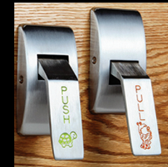
Custom Engraving Options