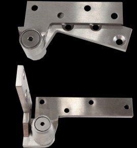
Pivots & Pivot Sets