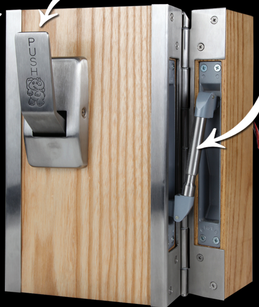
PT1000 Power Transfer