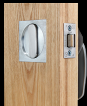
Ligature-Resistant Flush Pull (Flush Knob)