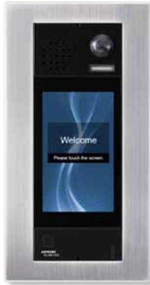
IXG-DM7-HID/A IP Video Door Station with HID® Card Reader

Our intercoms are SIP and ONVIF compliant, allowing seamless integration with leading providers of IP cameras, video management systems, and access controls. This open architecture empowers you to build a customized security ecosystem that evolves alongside your needs.