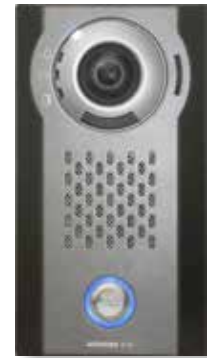
IX-DV IP Video Door Station