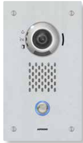
IX-DVF IP Video Door Station