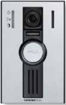
IX-EA 1-Gang Surface Mount IP Video Door Station