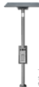
TWS-Z4 Sets also available for Zones 1 and 2

French versions available: IX-DVF-2RA-FR, IX-DVF-RA-FR, IX-SSA-2RA-FR, IX-SSA-RA-FR