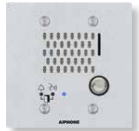
IX-SS-2G Audio Door Station