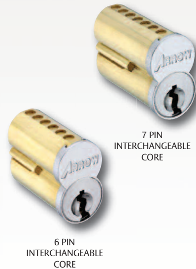
7 PIN INTERCHANGEABLE CORE