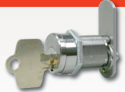
ARROW SFIC KEYWAY CAM LOCK

*Standard keying is KD. KA keying also available. Factory master-keyed orders are subject to standard keying charges.