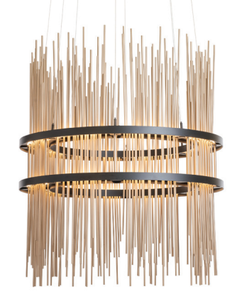
GOSSAMER CUSTOM 42" h x 36" dia