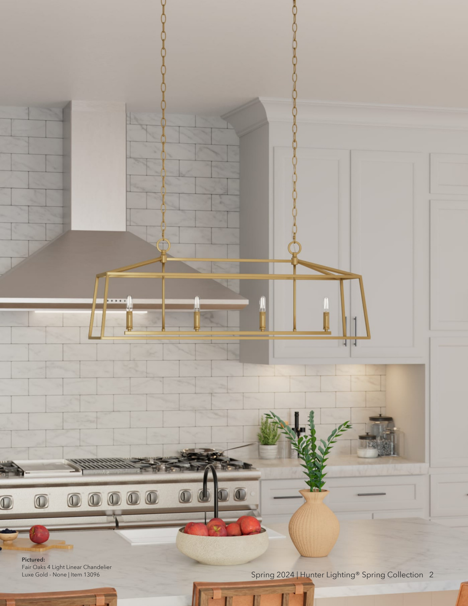
Pictured: Fair Oaks 4 Light Linear Chandelier Luxe Gold - None | Item 13096