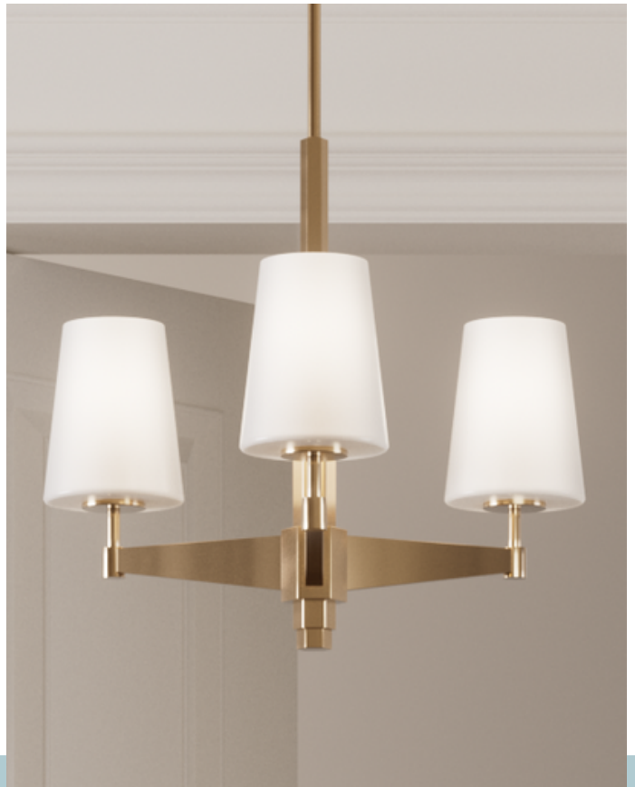
Pictured top row: Nolita 1 Light Wall Sconce. Nolita Mini Pendant Pictured bottom row: Nolita 3 light vanity, Nolita 3 Light Chandelier