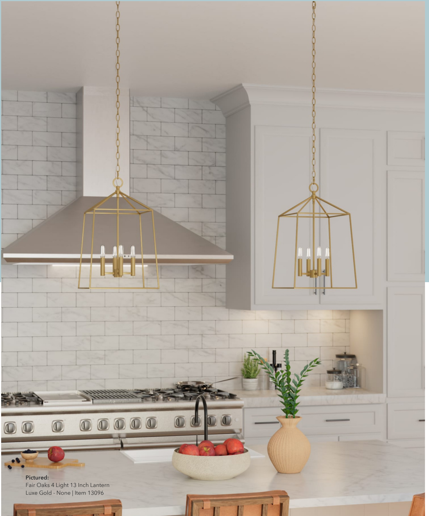
Pictured: Fair Oaks 4 Light 13 Inch Lantern Luxe Gold - None | Item 13096