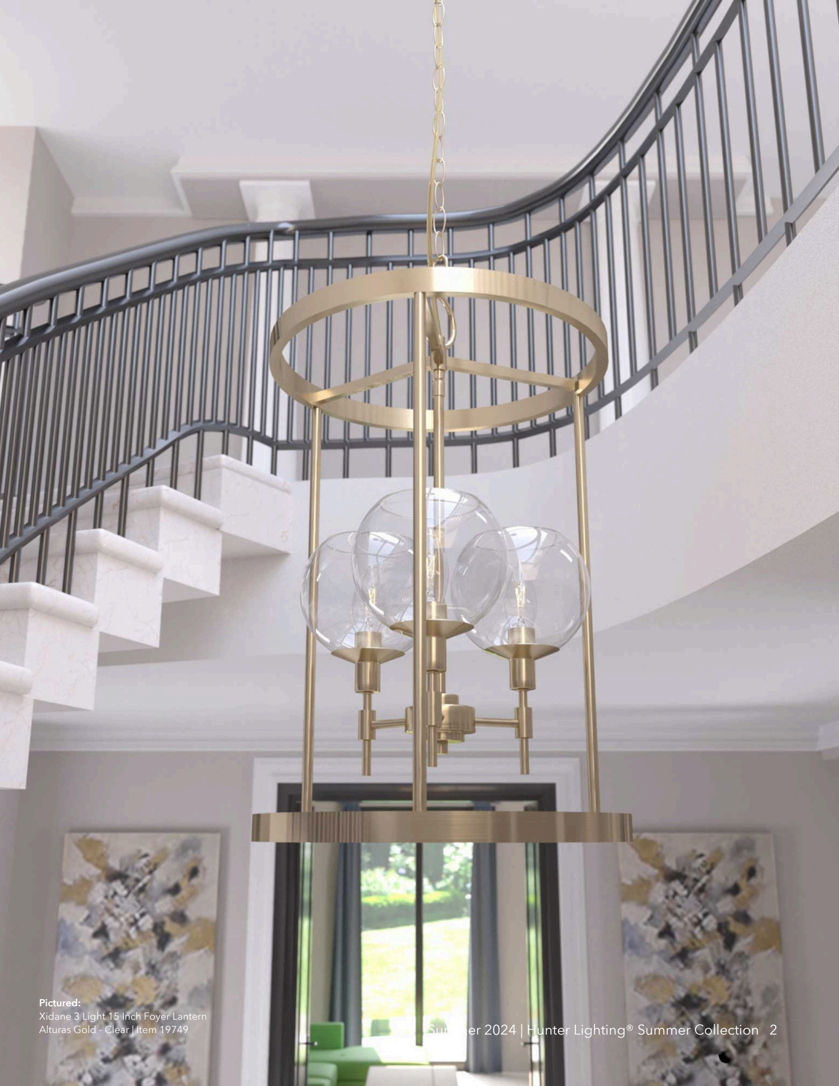
Pictured: Xidane 3 Light 15 Inch Foyer Lantern Alturas Gold - Clear | Item 19749