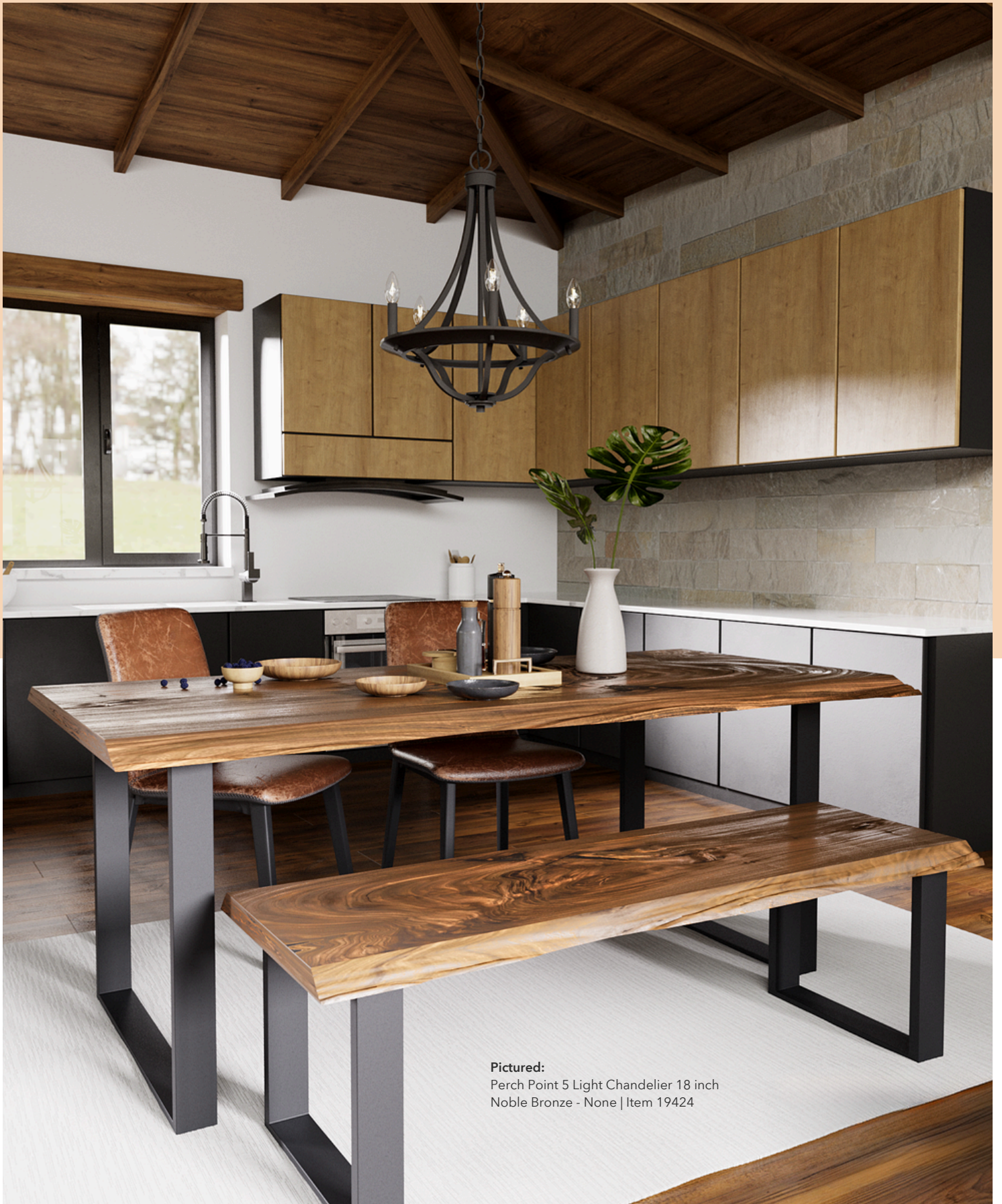
Pictured: Perch Point 5 Light Chandelier 18 inch Noble Bronze - None | Item 19424