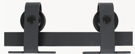
1000 Series -Top Mount