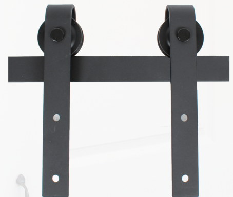
1000 Series -Bent Strap