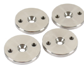
Track Mounting Bracket