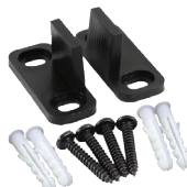
Adjustable Floor Guide