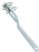
Hanger Mounting Tool