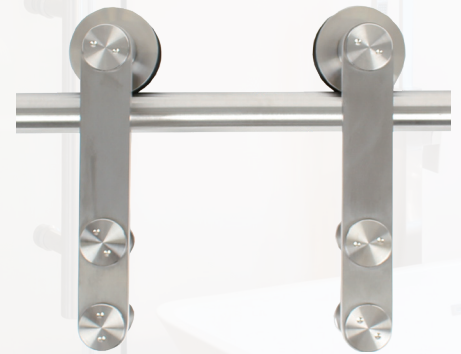
2000 Series –Straight Strap