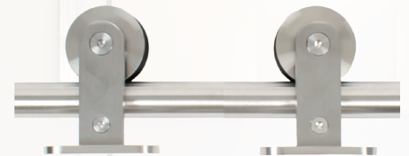
2000 Series –Top Mount