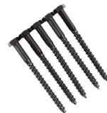
Track Mounting Screws