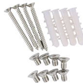
Track Mounting Screws