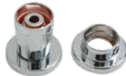
ABS Plastic Adjustable Flange Set