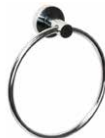
Circle Towel Ring