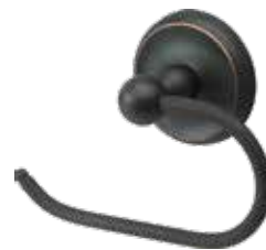
European-style Paper Holder