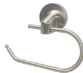
European-style Paper Holder