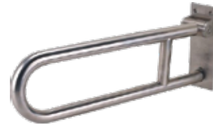
Swing Up Grab Bar (Peened Finish)