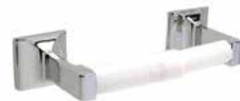
Paper Holder (White Roller)