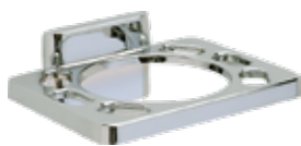
Toothbrush / Tumbler Holder