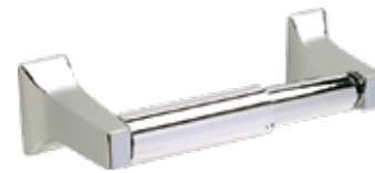
Paper Holder (Chrome Roller)