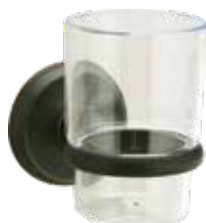
Toothbrush / Tumbler Holder