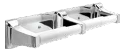
Surface Mount Twin Paper Holder