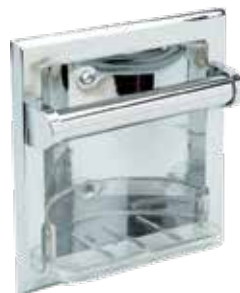
Deep Recessed Soap Holder & Grab