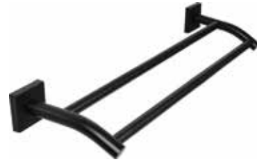
Double Towel Bar Set