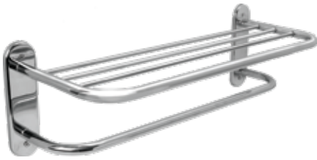
Towel Shelf with Bar