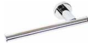
Straight Post Paper Holder