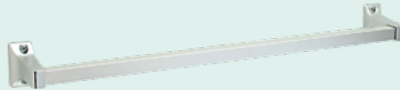
Towel Bar Set

Easy installation with exposed screws makes Edison the best solution for economical projects.