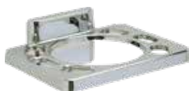
Toothbrush / Tumbler Holder