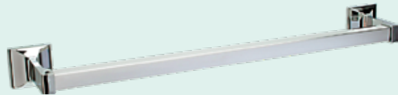
Towel Bar Set

Simple styling and quality expresses the look of Campbell. Its square base design and attention to detail complements any styling scheme.