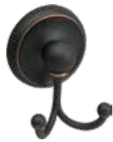
Double Robe Hook