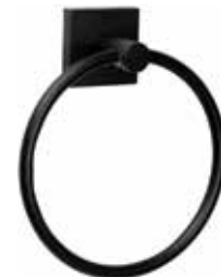
Circle Towel Ring