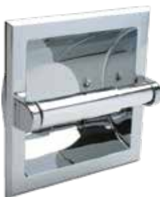
Deep Recessed Paper Holder