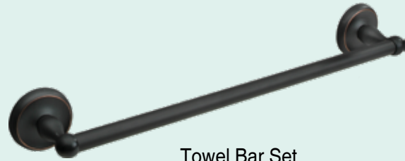
Towel Bar Set

Traditional and contemporary décor schemes can be easily achieved by the Carmel Collection's simple and practical appearance.