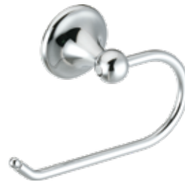
European-style Paper Holder