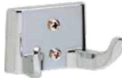
Double Robe Hook