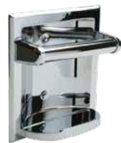
Shallow Recessed Soap Holder & Grab