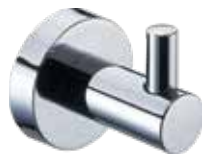
Single Robe Hook