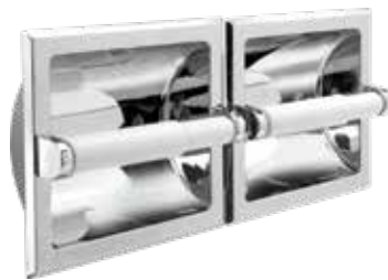
Twin Recessed Paper Holder