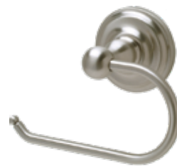
European-style Paper Holder