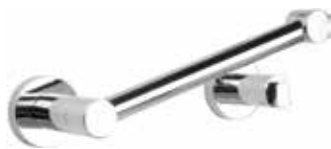
Pivot Paper Holder