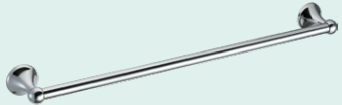
Towel Bar Set

The Estes Collection's timeless and classic design adds a soft yet sophisticated look to your bathroom while enhancing any decor.