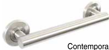
Contemporary Stainless Steel Grab Bar