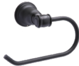
European-style Paper Holder