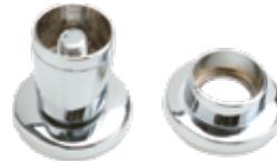
Zinc Adjustable Flange Set