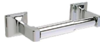
Paper Holder (Chrome Roller)