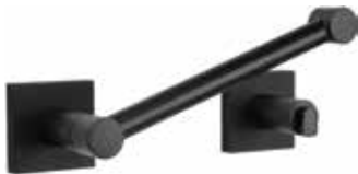
Pivot Paper Holder