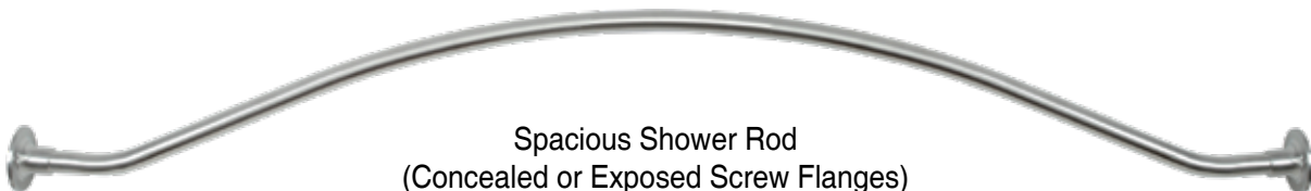
Spacious Shower Rod (Concealed or Exposed Screw Flanges)