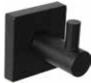
Single Robe Hook