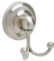
Double Robe Hook