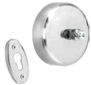
Retractable Clothes Line