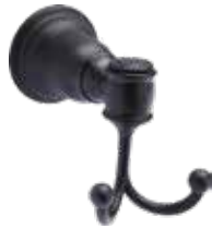
Double Robe Hook