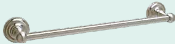
Towel Bar Set

The double waterfall sculptured edge gives the Ventura Collection a transitional styling advantage. Functional craftsmanship and lines are reflected in this fine collection.