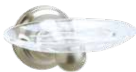
Toothbrush / Tumbler Holder