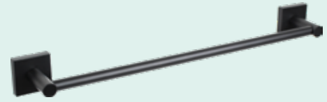
Towel Bar Set

Add a touch of elegance to your bathroom with our beautifully crafted accessories. Our Vina collection features a wide range of high-quality accessories, from towel bars to robe hooks, all designed with both form and function in mind.