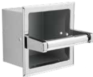
Recessed Extra Paper Holder