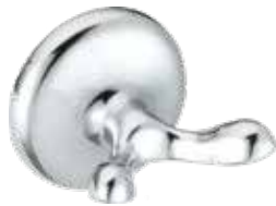
Double Robe Hook