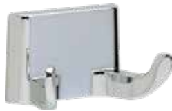
Double Robe Hook