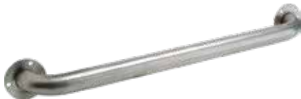
Stainless Steel Grab Bar (Exposed Screws)