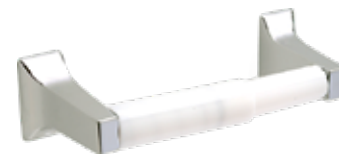
Paper Holder (White Roller)