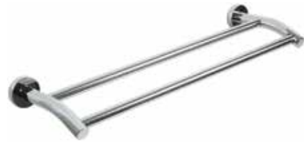
Double Towel Bar Set