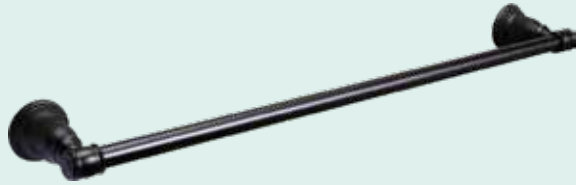
Towel Bar Set

The sleek design and round base of the Charleston Collection brings an air of sophistication to any home.