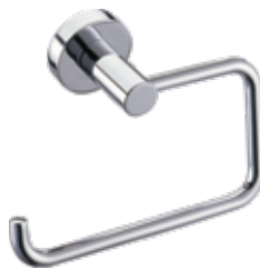
European-style Paper Holder