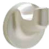
Single Robe Hook