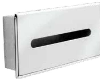
Recessed Tissue Dispenser