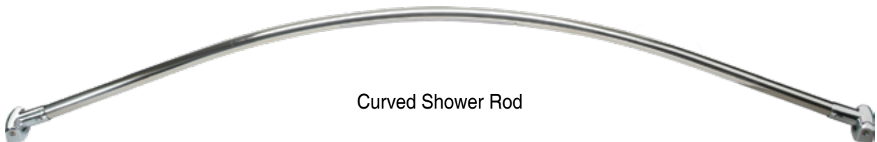
Curved Shower Rod