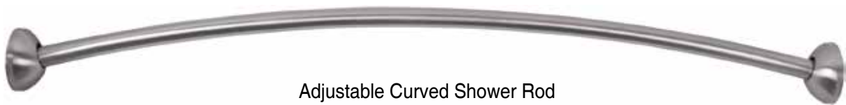
Adjustable Curved Shower Rod