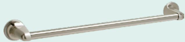
Towel Bar Set

The smooth post and circular base of the Seal Beach Collection offers a perfect balance of beauty and practicality.