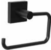
European-style Paper Holder