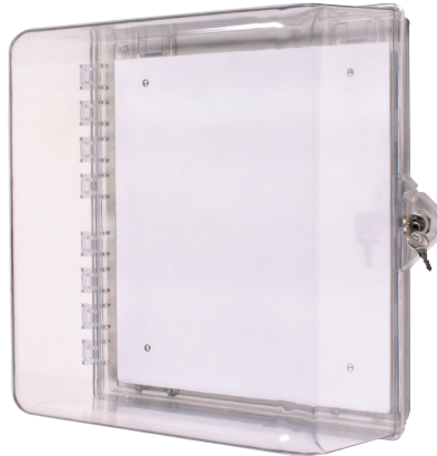
STI-7530 with Key Lock